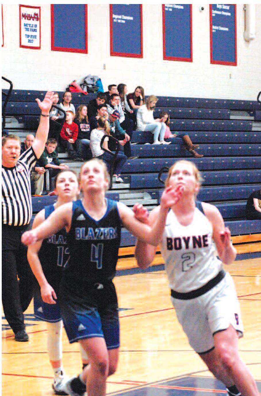
BOYNE CITY 59, KALKASKA 44

BOYNE CITY — The Ramblers were looking for some offense from other players.